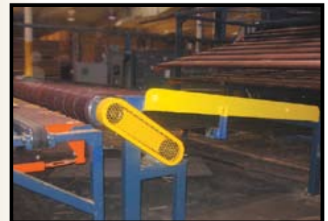
Drive shaft with guard