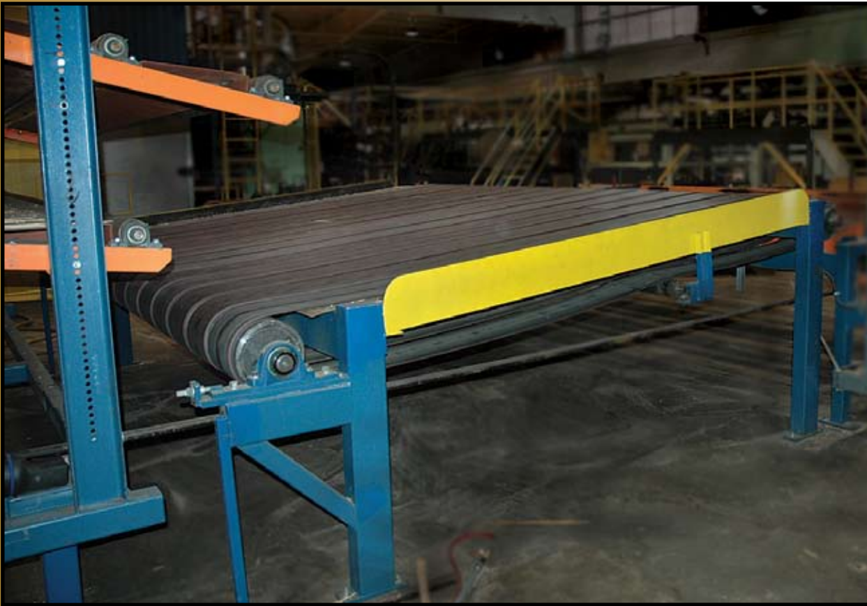
Westmill's Multibelt Conveyor

Westmill's Multibelt Conveyor improves sheet presentation to your Corner Transfer, enabling your veneer to move through the Corner Transfer without causing a jam-up.