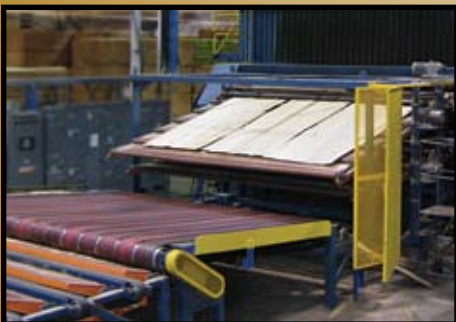
Our Multibelt Conveyor improves sheet presentation to your Corner Transfer.

Double-level Multibelt Conveyors are available for high-production Dryer lines to ensure that your Dryer Outfeed is not a bottleneck in your system.