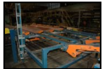
Reject Tipple (shown at right of picture)