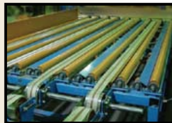
Fixed rolls with jump belts