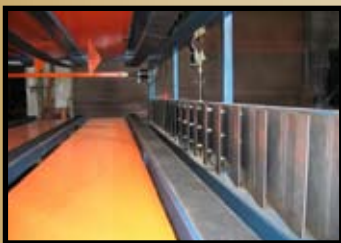
Pivoting Drop Pans with fixed Z-plate backstop

If you can't see it in a Westmill™ brochure, please ask! Westmill™ was founded on machinery rebuilding and providing custom solutions, and it continues to be a core part of our business.