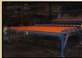
Pivoting Drop Pans with pneumatic squaring backstop